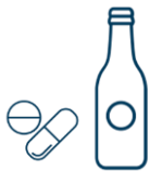
Drug and alcohol